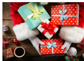
B. Boxing Day