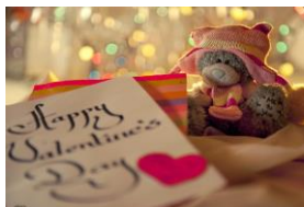
C. St. Valentine's Day