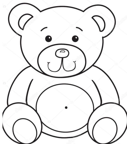
brown teddy bear