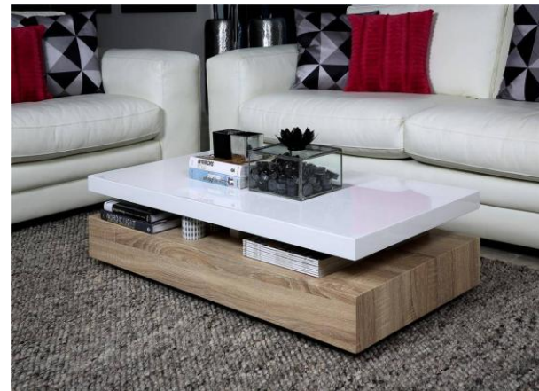
a coffee table