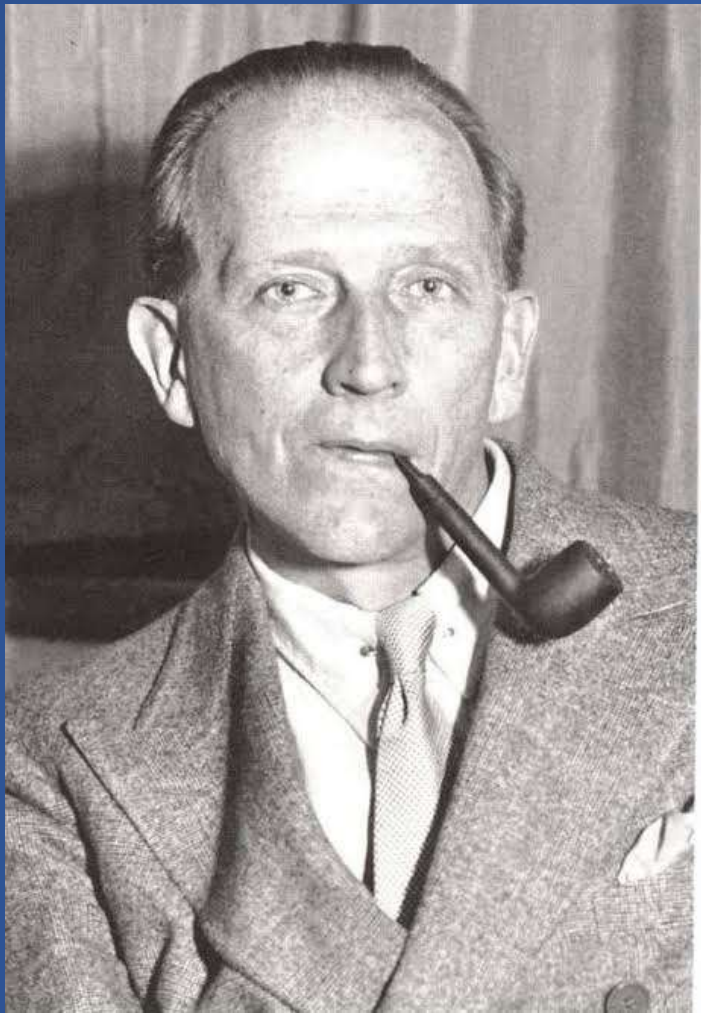
Alan Alexander Milne